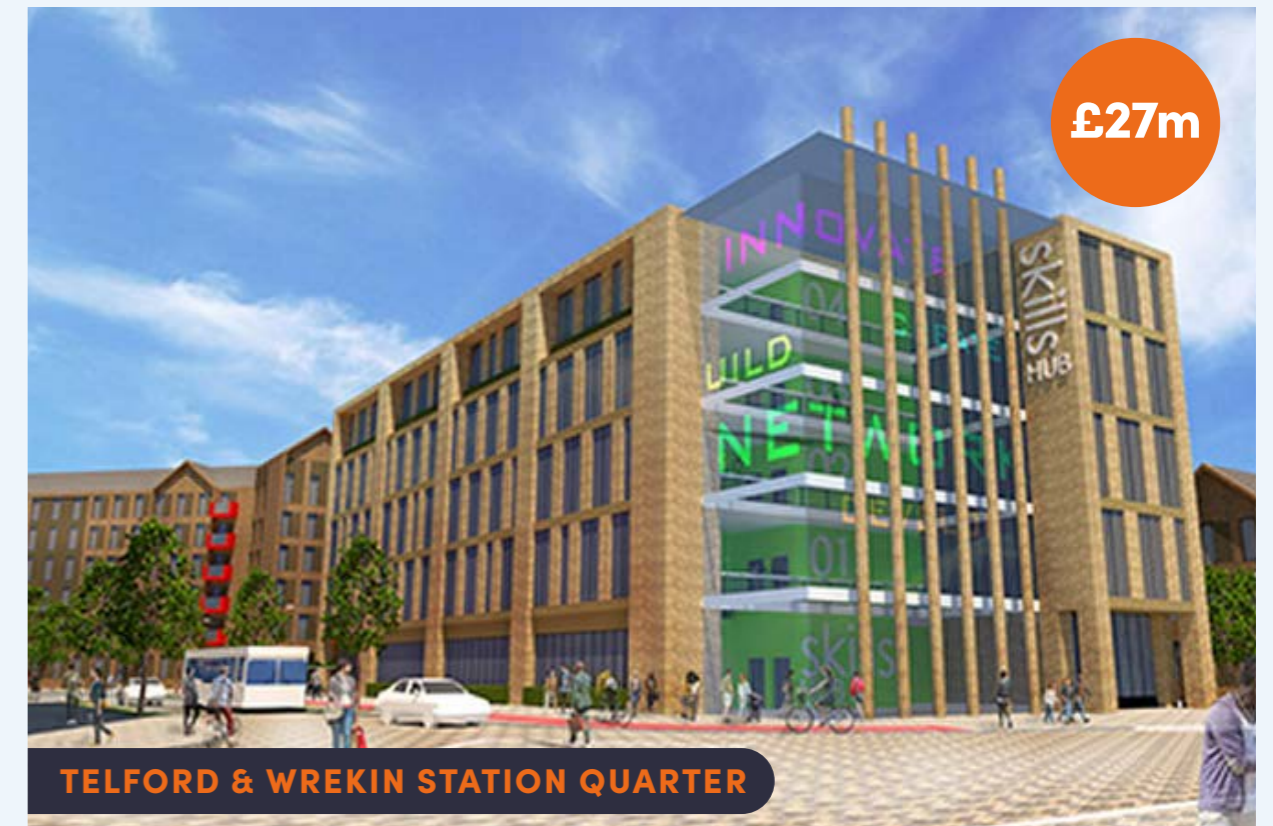
TELFORD & WREKIN STATION QUARTER

But the key focus is bidding on West Mercia Police (£16m) and Walsall Waste Transfer Station (£27m), two projects being developed with Lincolnshire County Council – St Lawrence SEND (£12m) and Sleaford Secure Children’s Home (£45m) – and the Telford & Wrekin Station Quarter (£27m) comprising, enabling works, residential, skills hub, possible hotel and public realm. This is a major project for the customer, ourselves and the region. It’s also a great steppingstone for securing other towns, high street, transformation and levelling-up funded projects.