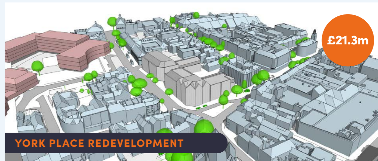
YORK PLACE REDEVELOPMENT

Just before the end of the year we secured another project for Milton Keynes Council, a £30m Agora redevelopment scheme , and we are awaiting cabinet approval on York Place Redevelopment (£18m).